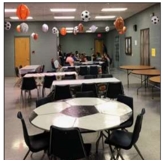
Craft Locker Room