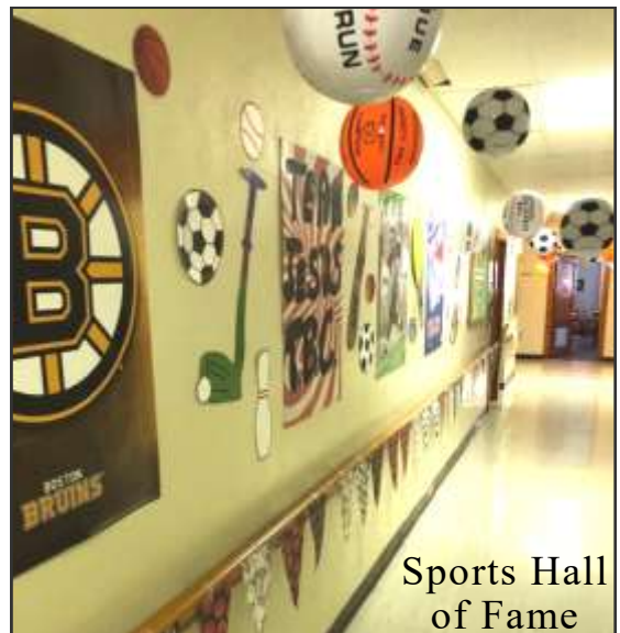
Sports Hall of Fame

I have included a few pictures of VBS 2018 - Game On!