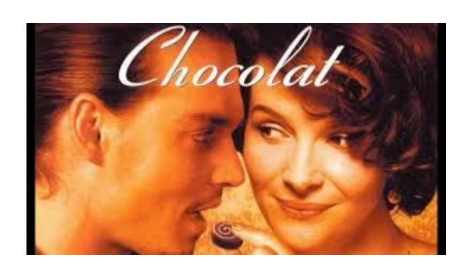
Nominated in 2000 for 5 Academy Awards

Look for more information in upcoming bulletins and Messengers.