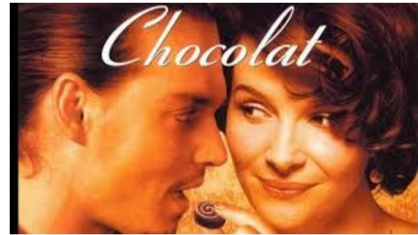
Nominated in 2000 for 5 Academy Awards

Look for more information in upcoming bulletins and Messengers.